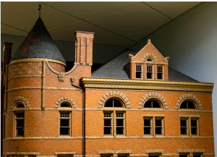
The Cox Building by Ashby & Jedd The roof-line of The Cox Building in 1/12 scale at the KSB Miniatures Collection.

The Cox Building in our gallery was used by architects and contractors to rebuild the roof line of the original building after a devastating fire.