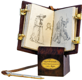
Rembrandt's Travel Sketchbook by Tine Krijnen The 1/12th-scale silverpoint sketches include 5 rare works by Rembrandt created in the summer of 1633.

People come from all over the world to see the Kaye Savage Browning Miniatures Collection at the Kentucky Gateway Museum Center . By November of this year alone, we had guests from 46 states and 17 countries to visit our galleries and research library. They come to see the magnificent works by artisans from England, Europe, and the Far East created in 1/12th scale.