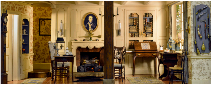
The French Regency Room from the KSB Miniatures Collection, featuring a portrait of General Lafayette

Lafayette was hailed as a “Hero of Two Worlds,” and when returning to France he was promoted to Brigadier General and became an honorary citizen of several states on a visit to the U.S. in 1784.