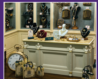
KSB Miniatures Collection's Savage & Sons jewelry shop by Mulvany & Rogers.