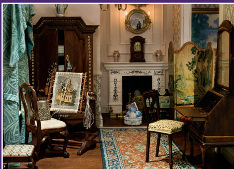
KSB Miniatures Collection's Chessington Plaza . Thimble for scale.