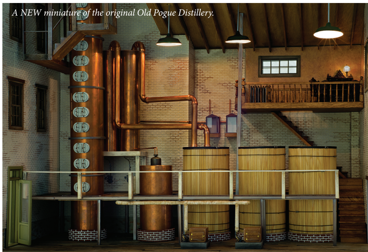
A NEW miniature of the original Old Pogue Distillery.

Due to increased demand, the Old Pogue Distillery completed a capacity expansion in Summer 2018. The distillery distributes its Old Pogue Master's Select Kentucky Straight Bourbon Whisky and Old Maysville Club Bottled-in-Bond Kentucky Straight Rye Malt Whisky in five states.