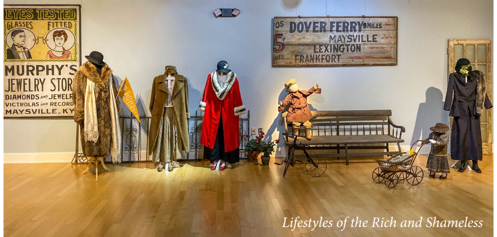
Lifestyles of the Rich and Shameless

Summers were hot in Maysville and there was no air conditioning. Fans helped some- electric or hand-propelled.