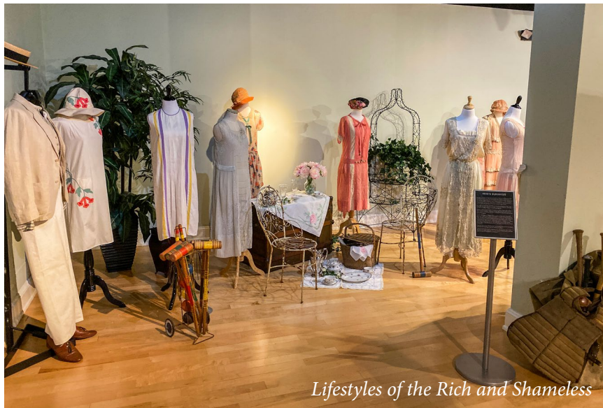
Lifestyles of the Rich and Shameless