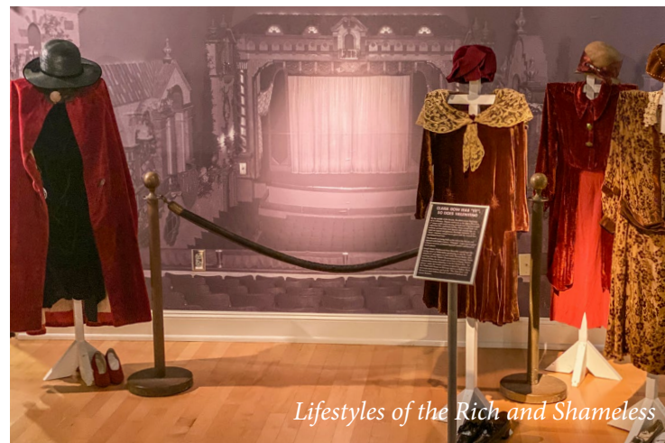
Lifestyles of the Rich and Shameless