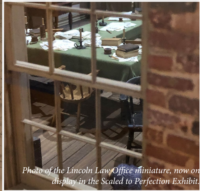
Photo of the Lincoln Law Office miniature, now on display in the Scaled to Perfection Exhibit.