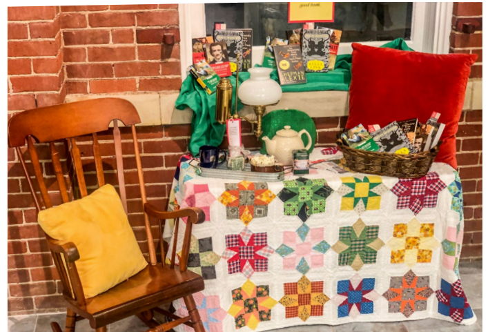
Select titles available in the atrium during our Books for a Donation promotion.

Remember winter is the perfect time for a visit to the museum exhibits or Old Pogue Experience . Take the time to check our new Books for a Donation table in the Atrium. Make a donation to the Education Outreach program and pick up a new book to enjoy on a winter day.